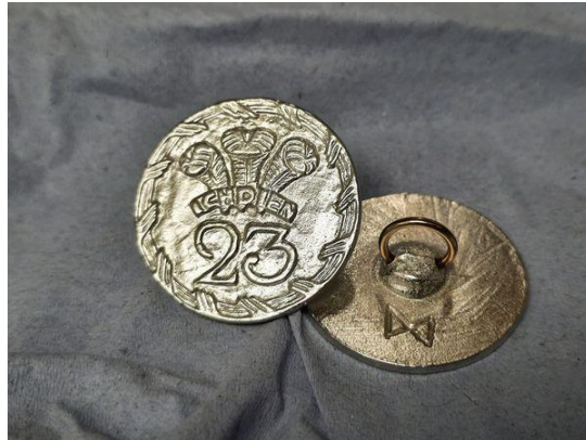
New Button coming